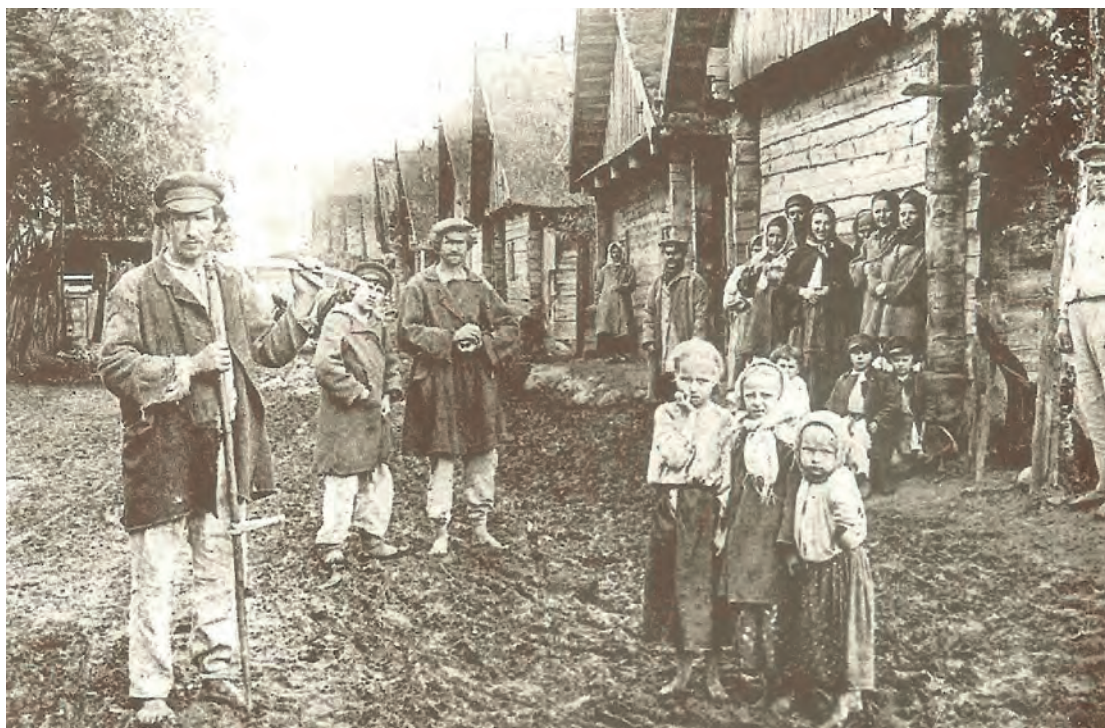
A photograph of a Russian village street around the beginning of the twentieth century.

11 Look at the photograph, and then answer the questions which follow.