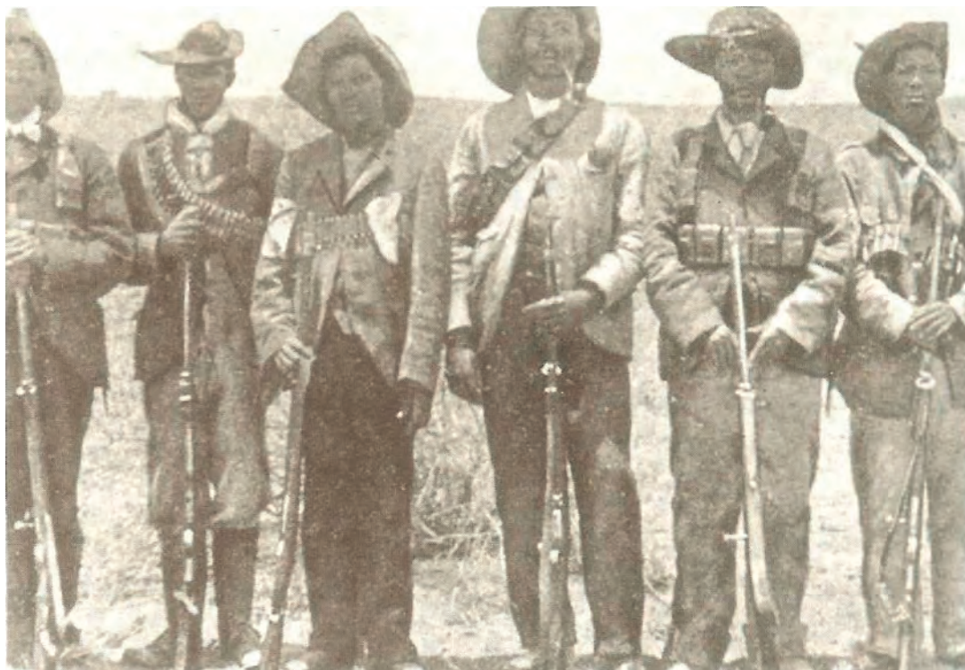
A photograph of Marenga and his guerrilla fighters in 1904.

19 Look at the photograph, and then answer the questions which follow.