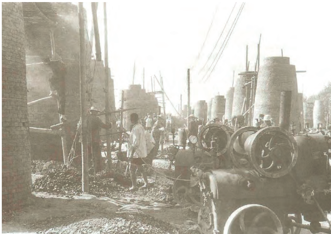
A photograph of 'Backyard Furnaces' in use during the Great Leap Forward.

15 Look at the photograph, and then answer the questions which follow.