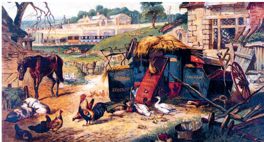
A painting of a country scene produced around 1845.

22 Look at the painting, and then answer the questions which follow.