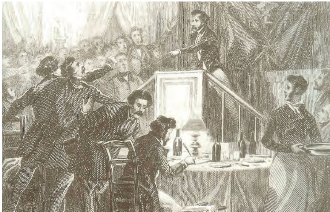
An illustration of a reform banquet held in Paris in 1847.