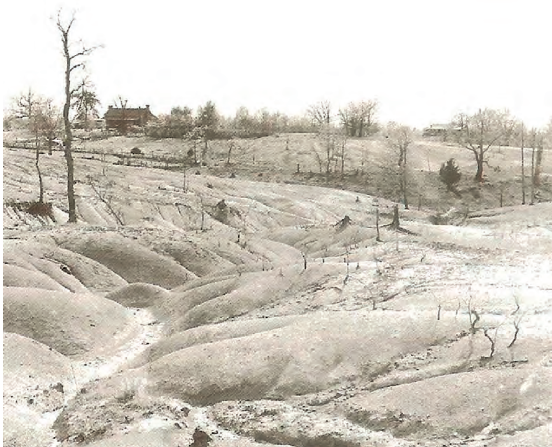
A photograph showing the effects of erosion in the Tennessee Valley.

14 Look at the photograph, and then answer the questions which follow.